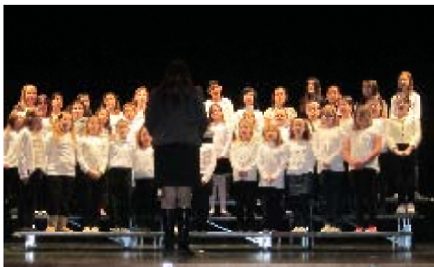
Cardinal Newman School Choir